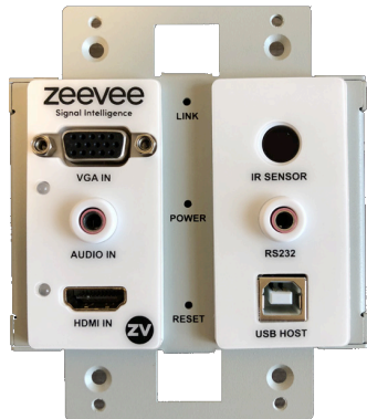
ZyPerUHD-WE: Wall Plate Encoder