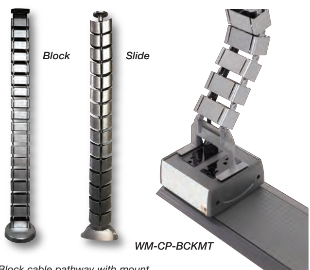
Block cable pathway with mount. *Sold as complete assembled part.