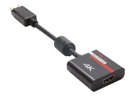
Model GC-DP-HD: DisplayPort source to HDMI output

To connect to a source (PC) with Displayport output, use GC-DP-HD.