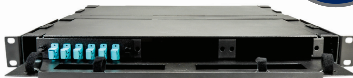
Enclosure shown with partial installation. Enclosures are sold empty.

The SSF-1RU-E3 is a 1RU fiber distribution panel that can accept up to 3 SSF™ Adapter Plates. The enclosure includes a slide out master panel that allows for easy access of terminations, fiber management and splicing. The unit includes two-position rack mount ears and features an easily removable cover without screws.