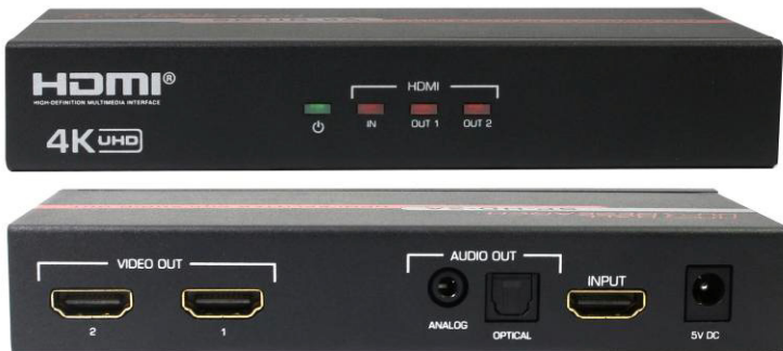
Figure 3 – Front and Rear Panels

If source is sending multi-channel audio, the 3.5mm analog output is muted and extracted audio output will only be available as digital on the TOSLINK optical output.