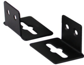
Figure 1 – Included Brackets

For convenience a pair of mounting brackets and hardware are provided so it can be easily surface mounted.