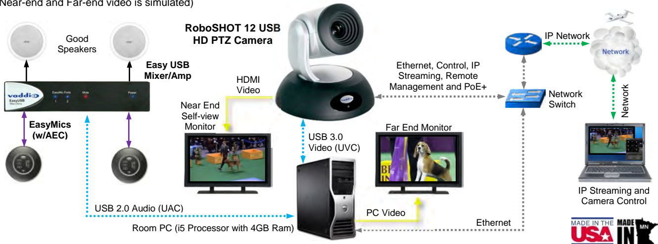
RoboSHOT 12 USB, EasyUSB™ Mixer/Amp, EasyMics, UC Conferencing Application, Monitors and Speakers (Near-end and Far-end video is simulated)