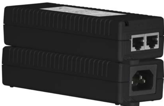
FIG. 1 PS-POE-AF-TC Power-Over-Ethernet Power Supply

The PS-POE-AF-TC supports the IEEE standard PoE pinout: Pins 4&5 Power (+) / Pins 7&8 Power (-). See Pin Connections (on reverse) for details.