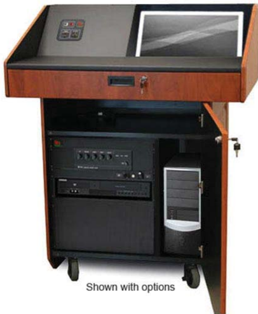
Shown with options

AVF's roll-about multimedia podiums are the ideal solution for distance education, electronic classrooms and corporate training sites. Extra charge for custom cutouts for electronics or other items specified by the customer.