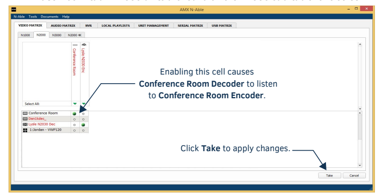
FIG. 3 VIDEO MATRIX

Double-click the unit's name (in one of the lists mentioned above) to view its control pages. If prompted, enter admin and password for the default username and password. Once logged in, you can change the username and password (using the options on the unit's Settings page, shown below).