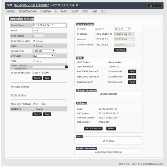
FIG. 4 N2000 SETTINGS PAGE

NOTE: If you would like for N-Able to support auto-login to your units, make sure N-Able's Device Auto-login settings match the unit's username and password (by selecting N-Able > Settings from the N-Able tool bar).