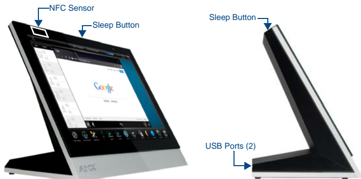
FIG. 1 MXT-1001

The MXT-1001 features edge-to-edge capacitive touch glass with multi-touch capabilities. It features advanced technology empowering users to operate AV equipment seamlessly, while providing the ultimate in audio and video quality. The distinctive appearance will complement even the most sophisticated meeting facilities and homes.