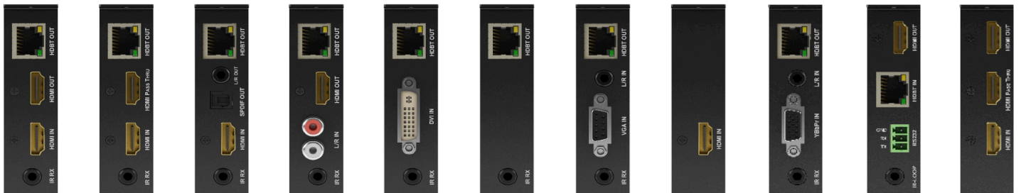
TX-POH-010 TX-POH-020 TX-POH-030 TX-POH-040 TX-POH-050 TX-POH-060 TX-POH-070 TX-POH-080 TX-POH-090 TX-POH-100 TX-POH-110

TX-POH-010 - HDBaseT Out, HDMI Out, HDMI In, IR In