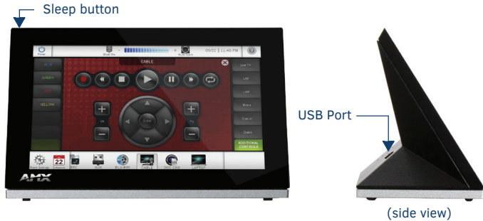
FIG. 1 MT-702

The MT-702 (FG5969-53) 7" Modero G5 Tabletop Touch Panel features the G5 Graphic Engine, Quad Core Processor, and a capacitive multi-touch display. The touch panel features advanced technology empowering users to operate AV equipment seamlessly, while providing the ultimate in audio and video quality.