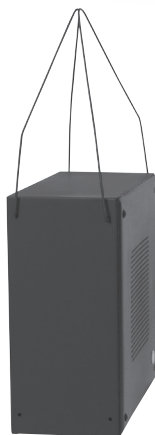
M1000 Horizontal Dispersion Setup