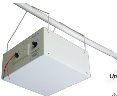
M1000-W Upward Dispersion Setup