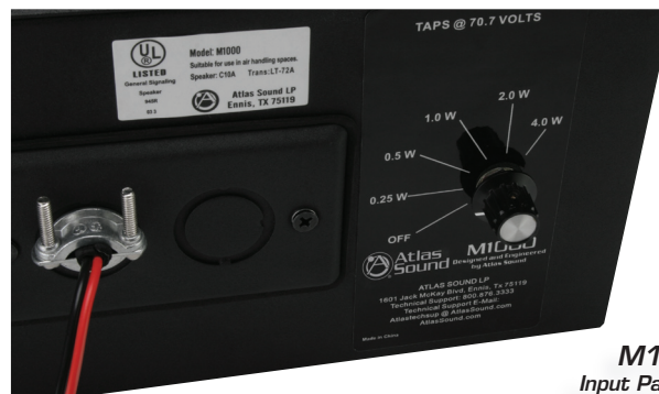
M1000 Input Panel & Tap Selector Switch

The CRS enclosure shall measure 11⅞" (243 mm) L x 11⅞" (243 mm) W x 5½" (140 mm) H and have a volume of 734 in 3 (12,075.1 cm 3 ). It shall include fiberglass material to further dampen the enclosure. Baffle shall be a sturdy steel one-piece CRS grille measuring 11⅞" (243 mm) L x 11⅞" (243 mm) W. Grille shall have a perforated loudspeaker opening. Baffle and enclosure shall be finished in textured black epoxy or white epoxy finish on the M1000-W. Assembly shall include a dual suspension hanger system which fastens via holes provided on the enclosure. Hangers shall be adjusted for (upward, downward or horizontal _____ radiation.)