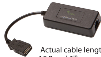
REX (Remote Extender)