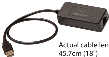
LEX (Local Extender)

The USB 1.1 Rover 1850 extends USB 1.1 connections beyond the desktop up to 85* meters.