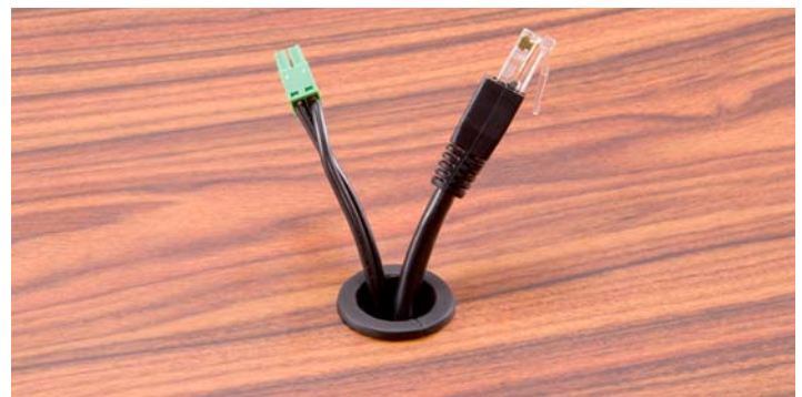
FIG. 3 Topside of Installed Unit