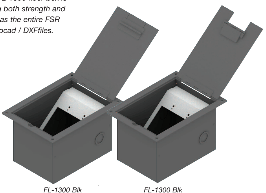
FL-1300 Blk (Large door open)

Finish: Black or Oak Sandtex paint option