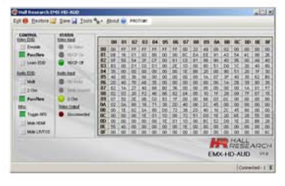
Hall Research EMX-HD-AUD GUI / Uploader