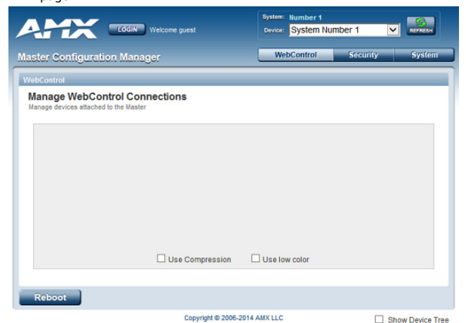
FIG. 2 WEBCONSOLE (MAIN PAGE)