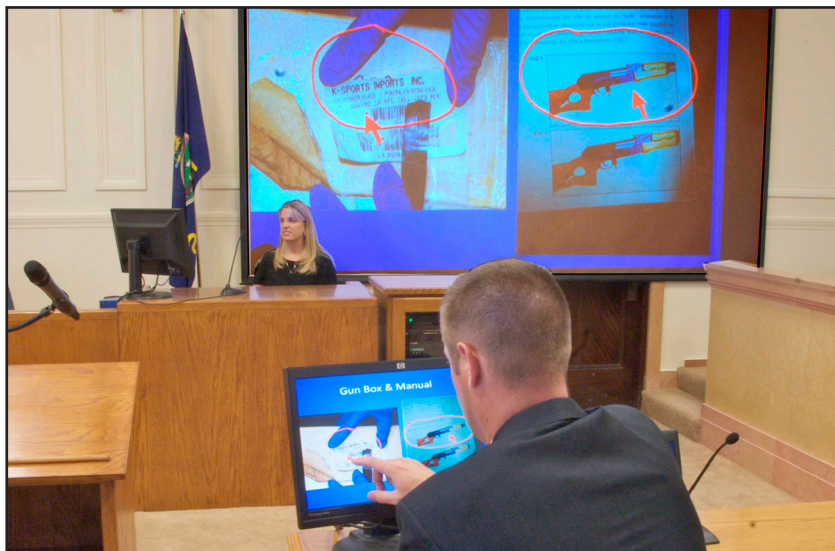
Pointmaker annotation being used in a county courtroom to point out important details of evidence to judge and jury.