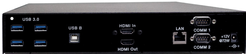
Back panel illustration of the Pointmaker CR-100 courtroom annotation system.