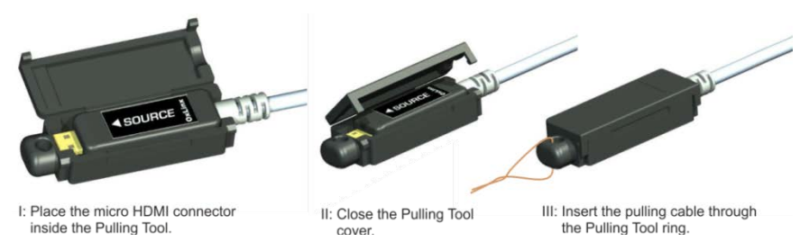
Figure 3: Attaching the Pulling Tool

3. Attach the pulling cable to the Pulling Tool.