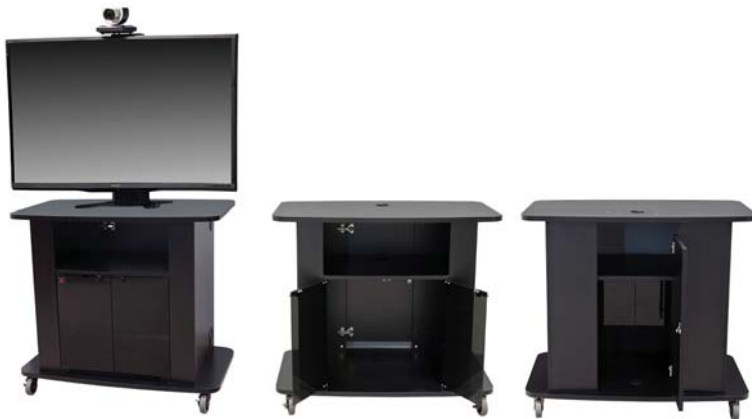
Shown with optional mount (Sold separately)