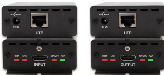
Figure 2 – Front and Rear Panels of Sender / Receiver

The HDMI Connectors are clearly labeled as INPUT and OUTPUT.