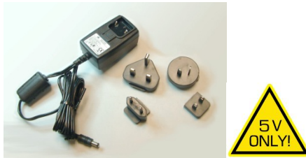
Figure 1 – Power Supply with international switchable blades

The kit package should contain a Sender (-S), a Receiver (-R), and two power supplies (one for each end). The power supplies are universal (100~240VAC, 50~60Hz). Model number 511-3A-161WP05, 5v @ 2.6A with 2.1mm plug.