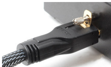
Figure 3 – Locking HDMI Cable