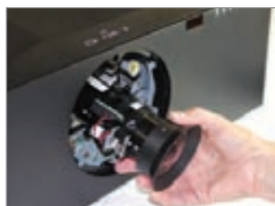
Easy to change lenses.