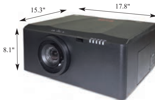
EK-612XA • XGA • 1-chip DLP® projector.