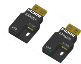
Figure 1: HDMI Connector plugs (Source and Display)

The CLS-AOCH/xl / CP-AOCH/xl has a slim design to let you pull the cables easily (together with the supplied pulling tool) through small-sized conduits.