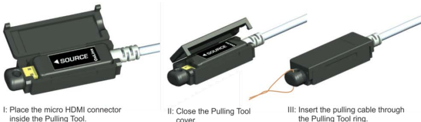
Figure 3: Attaching the Pulling Tool